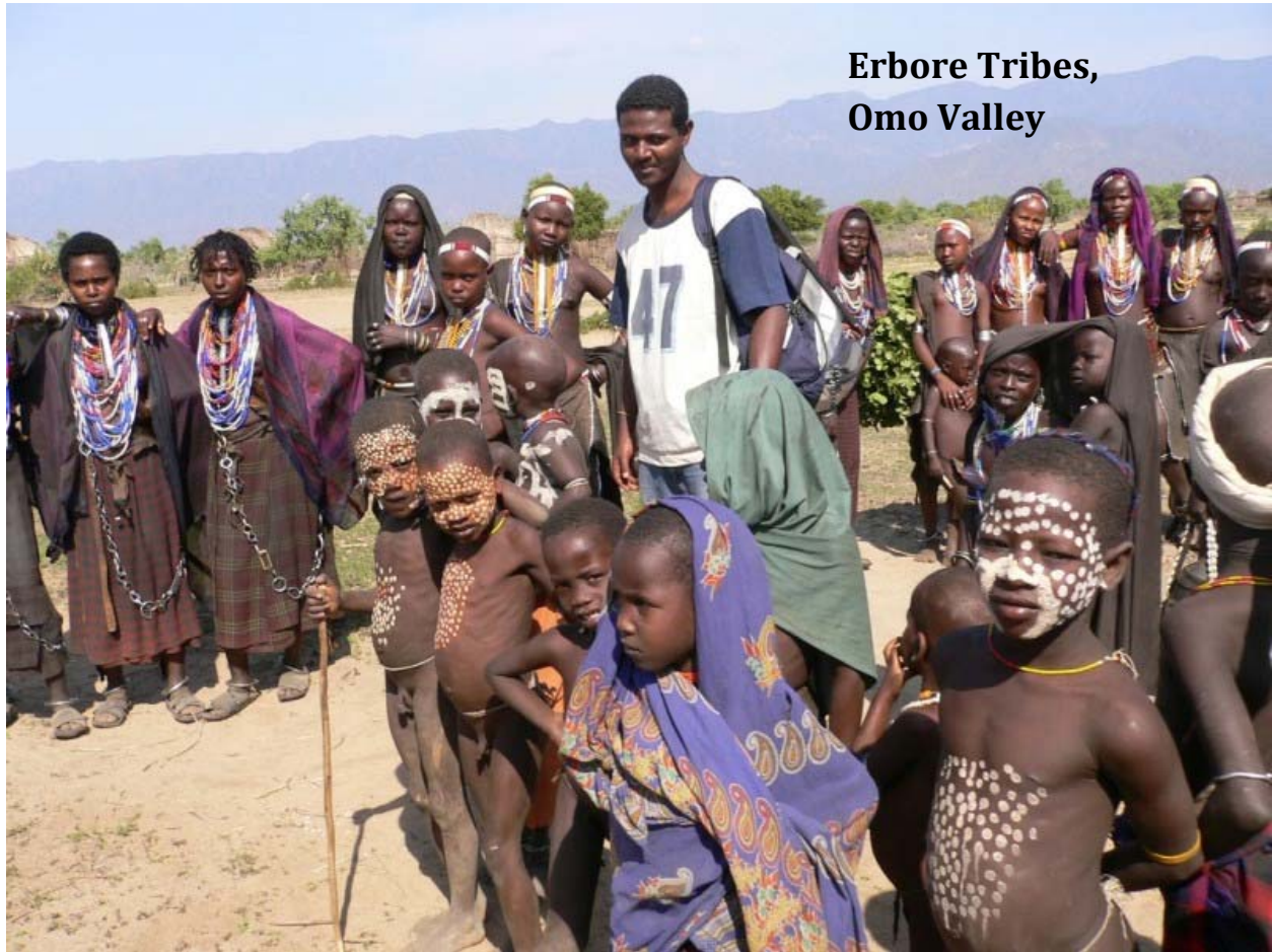
Erbore Tribes, Omo Valley